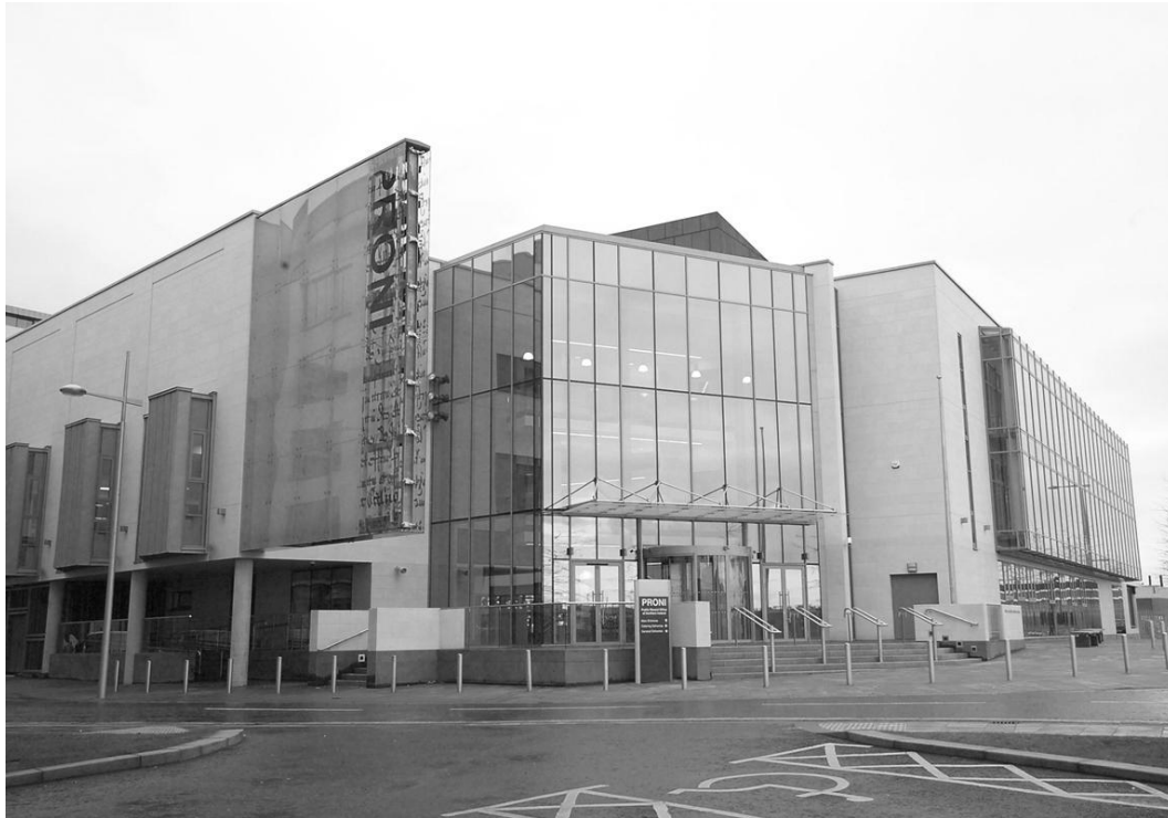
Figure 1: Public Record Office of Northern Ireland

available online through this website. However, the comprehensiveness of the coverage varies and not every available church or civil record is available.