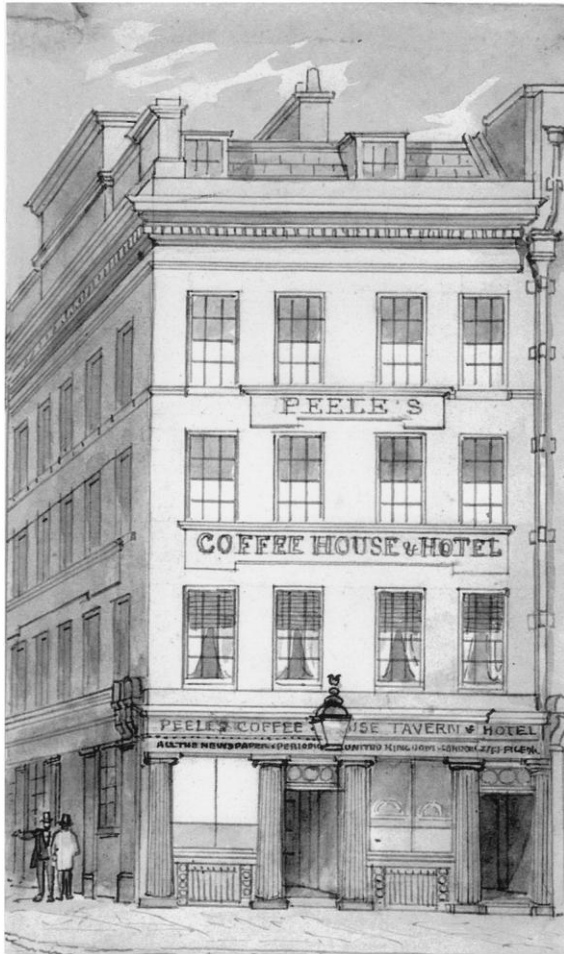
Figure 1: Peele's Coffee House