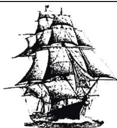
Cover image: Logo of the Ulster Historical Foundation, reflecting its links with the Irish diaspora around the world.